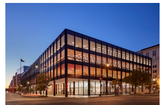
Martin Luther King Jr. Memorial Library, Washington, DC, US