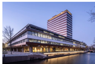
De Nederlandsche Bank, Amsterdam, NL