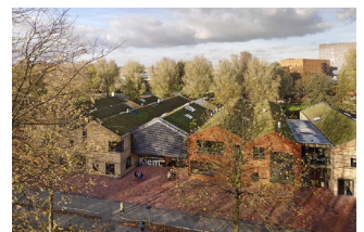
Kiem Special Care School, Dordrecht, NL