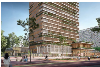
Uniek - Utrecht University, Utrecht, NL