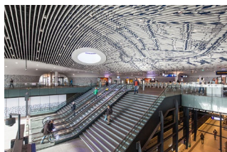
Municipal Offices and Train Station, Delft, NL